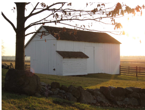
Brian Barn on the Gettysburg Battlefield.

converged on the center, and when Abraham Brian and his family returned after the battle, they found the house scarred with bullet and shell holes, the crops trampled, the orchard ruined, and their furniture dragged into the yard. The pasture near the barn had become a cemetery. Brian later filed for damages amounting to $1,028. He died intestate on 30 May 1879. 310